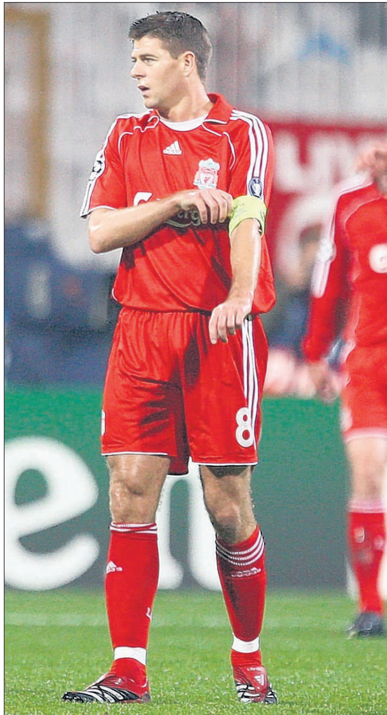
No dream return: Gerrard could not rescue Liverpool